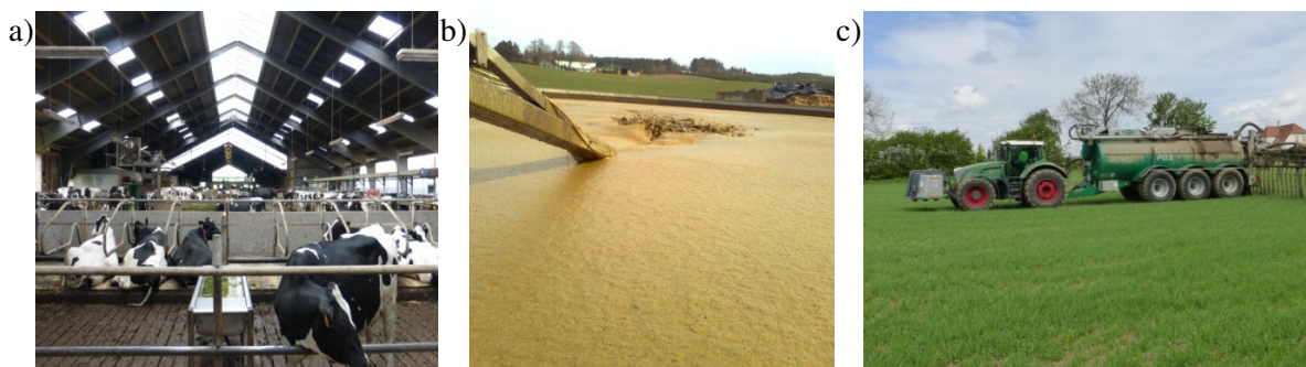
Fig. 2. Applicable acidification techniques: a – in-house; b – in-storage; c – in-field

Sulfuric acid is generally applied, since it is easy to use, affordable and relatively cheap. Besides, sulfur can be used for crop nutrition instead of mineral additives.